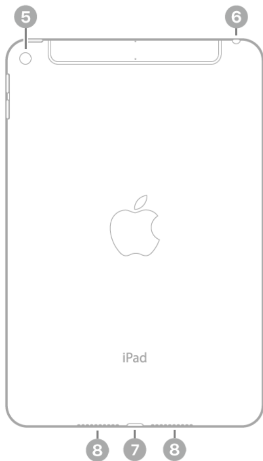
Figure 3.2 Side Views